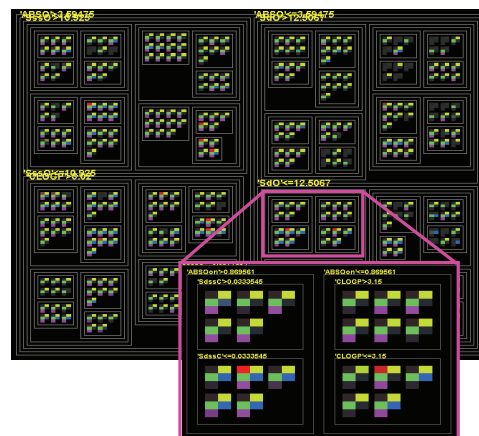
Figure 1: (Upper) Example of hierarchical multi-dimensional data visualization. (Lower) Zoom-in view of a part of the data.

Figure 1 shows an example of visualization result of hierarchical multi-dimensional data by our technique, and its zoom-in view of a part of the data. This example shows that we need zoom-in operations to visually recognize each value of leaf-nodes of large-scale data. In other words, it may be difficult to visually recognize the values of every leaf-node of the large-scale data in one display, since the leaf-nodes are displayed very small. To solve the problem, the technique provides a level-of-detail (LOD) control technique that adjusts the number and sizes of icons on the display, by unifying lower-level nodes as a representative higher-level node.